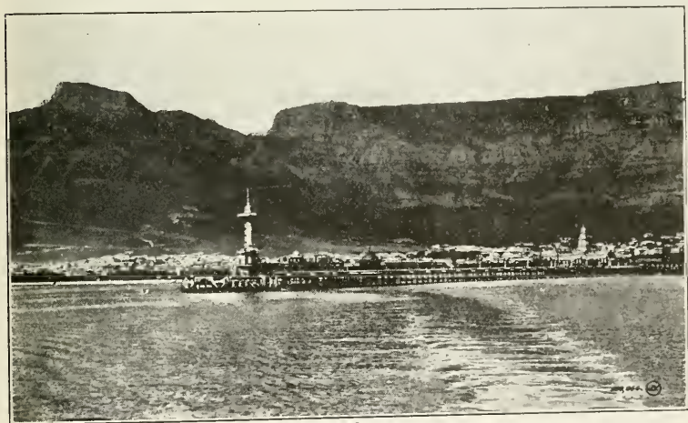
PROMENADE PIER AND TABLE MOUNTAIN, SOUTH AFRICA

Table mountain rises to a height of three thousand five hundred and eighty two feet (3,582) and is flat on top, with a general slope towards the south. Here the city has builded a number of reservoirs which are filled with water from the clouds. In the winter season, when it rains all the time, it is not so wonderful that the reservoirs should be full; but in the summer time, when we have no rain for three months, it would take a wonderful basin to hold enough water for one hundred and seventy thousand people with their domestic animals and gardens. Here is where